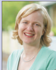
Verity Firth Minister for Women

While women continue to be under-represented in leadership and decision-making positions, programs such as 'Lucy' make an important contribution in helping to redress this imbalance.