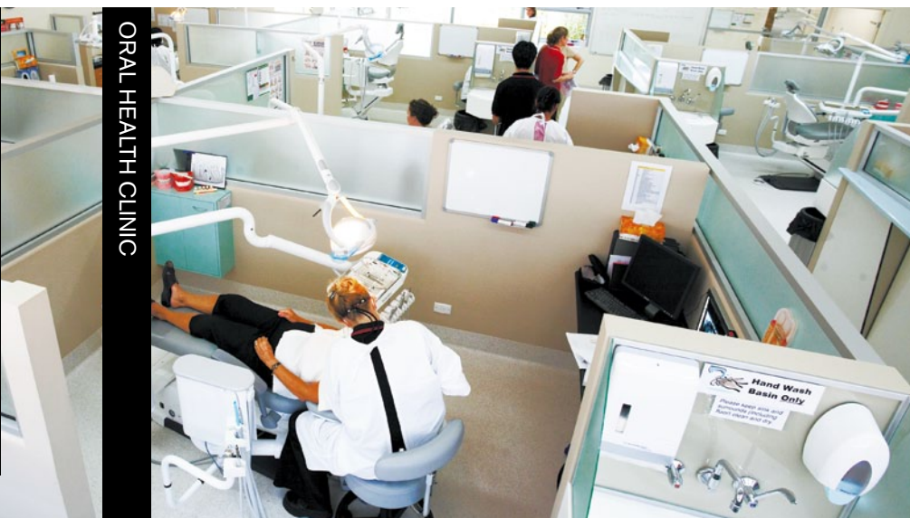
ORAL HEALTH CLINIC