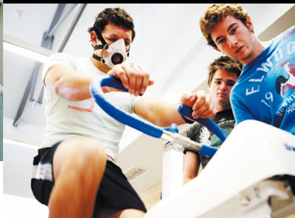
EXERCISE SCIENCE LAB