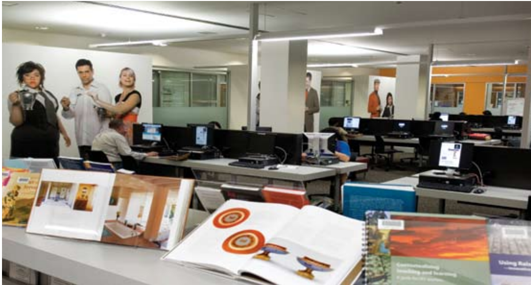
The new Auchmuty Library foyer