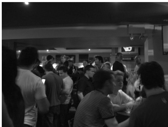
Fig 4. Mass of Faces (Peter Bower)

Appropriately enough, this is a feedback loop; the crowd influences the vibe, while the vibe influences the crowd; the entertainment