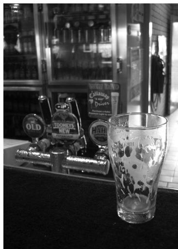
Fig 8. Last Drink (Peter Bower)

As the Irish Guinness is poured, and people stand on the cold slate, resting a foot on the tarnished brass rail that surrounds the base of the bar, the artifice of the Irish pub is slowly fading, but claim of authenticity still lingers. Move upstairs and you find yourself in a crowded nightclub-esque environment, the horseshow bar passing out drinks in all directions while the DJ mixes tracks with too much bass, attempting to cater to the needs and wants of the young crowd, while bouncers stand solid and vigilant. As one of several inner-city pubs struggling to find its feet and deal with the pub-related violence and its enforced restrictions, it has recently, and suddenly, found itself with an identity crisis: lost is the craic and true sense of an Irish pub. And so the only question that remains is the Chicken or the Egg question of pub and club cultures. What shapes what? Do establishments shape the patrons and their behaviours, or do the patrons shape the establishments? And, as both influence each other in an eternal cycle, creating the piercing feedback loop, this is a question that can never be answered.