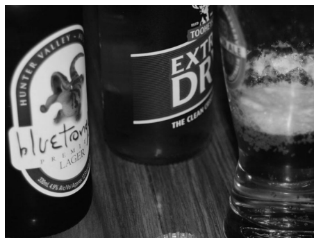
Fig 8. Serving more than Guinness (Peter Bower)

Finnegan's has been losing some of the "Irishness" it never had, with the green and yellow stained windows now only at the front of the restaurant and no longer in the main bar area. The bay windows that existed until 2007 sporting an array of nautically themed objects—steering wheels, brass telescopes and maps that created the illusion that it was possible to find your way home—have been replaced with clear glass windows that allow the world to look in. It is