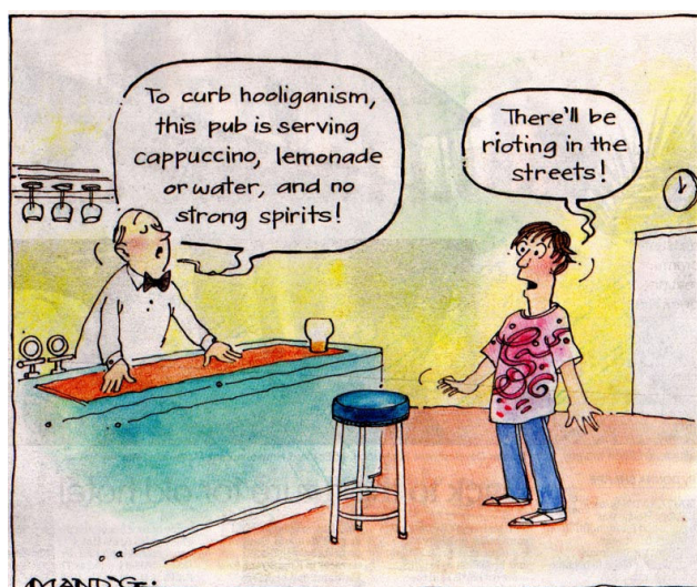
Fig 6. Editorial Cartoon January 10, The Herald (MandyG)

Country, has recently disconnected the kegs and closed its doors. A place that became a favourite of many for its $2 alcoholic shots (banished with the alcohol restrictions)