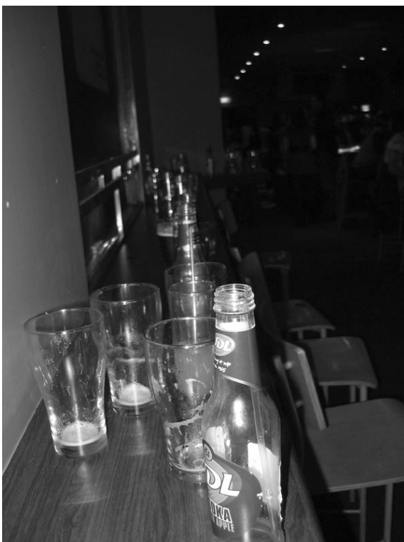
Fig 2. Line of Soldiers (Peter Bower)

In a culture where the aforementioned sins are prevalent, many put up a front or artificial persona. Short skirts and low cut tops for girls—even