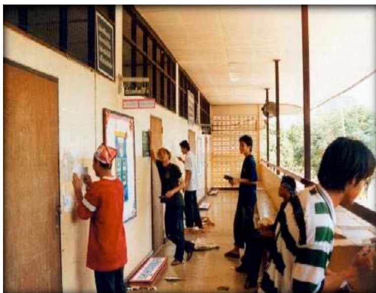
Fig. 8 Repairing the school building