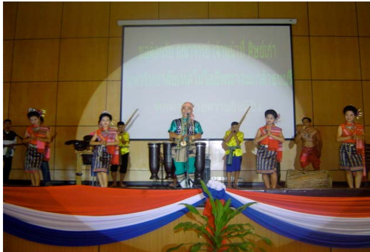
Fig.3 The result of learning typical music