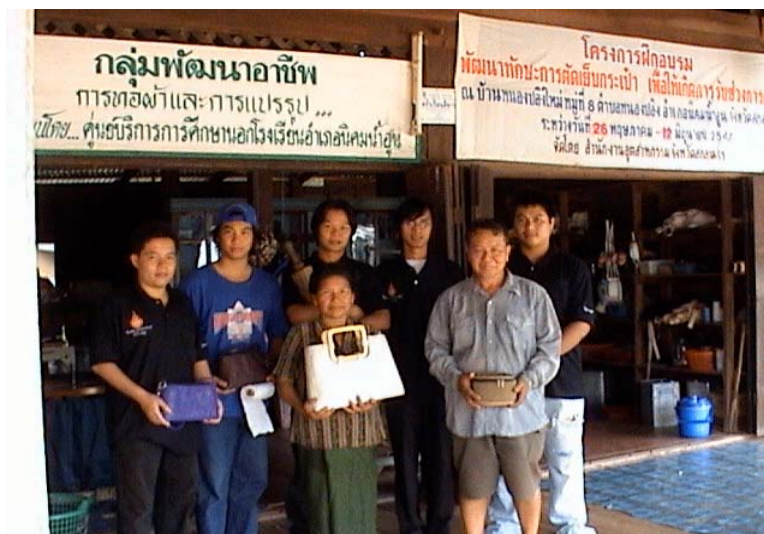
Fig.5 learning locality organization