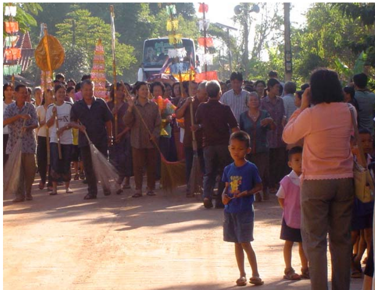
Fig. 7 Participated in local festival