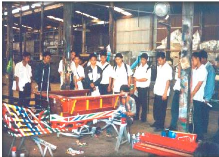
Fig.4 Mechanical students learning from local factory