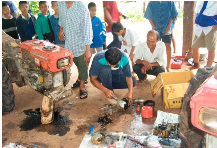
Fig.6 Training community about repairing agriculture machine